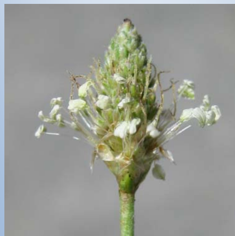
The flowers form a ring at the base of the spike and open sequentially.