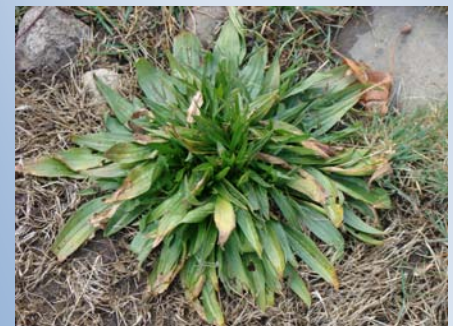
Rosettes grow close to the ground