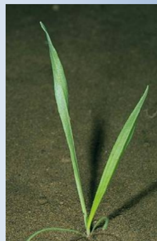
Seedlings have long, narrow leaves.