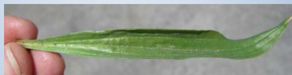
The leaves are long and narrow, with 3 to 5 obvious veins.