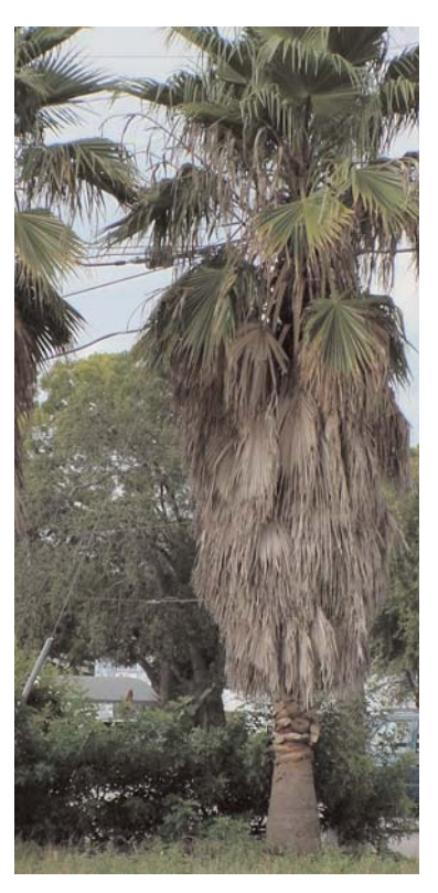
Incorrect pruning caused "pencil neck" in this palm