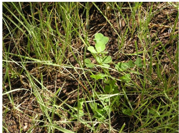
More weeds grew in the erosion control plots than turf plots. Perhaps this was due to a lower seeding rate than in the turf plots, providing less competition for the weeds.