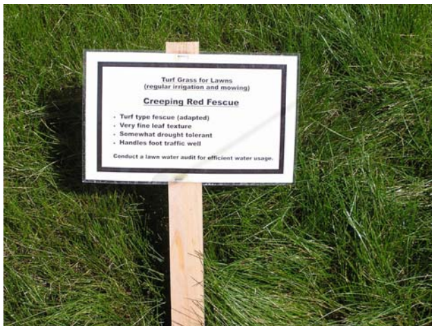
Turf Mix 4: creeping red fescue after three months