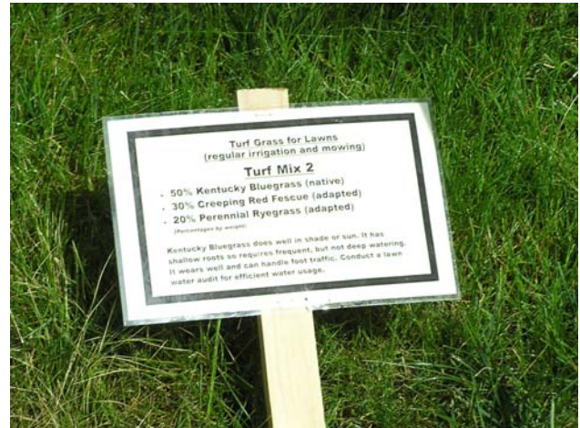
Turf Mix 2: bluegrass/fescue after three months

quickly forms a turf with its strong spreading rhizomes (NRCS, 1997). It has a fine leaf texture. It can be long-lived at high elevations (FEIS) and tolerates shade well.