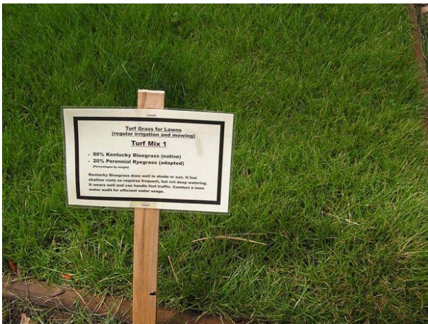
Turf Mix 1: Kentucky bluegrass after three months

Perennial ryegrass is a short-lived perennial grass that establishes quickly, but is shade intolerant. It is often used in a lawn seed mix to fill in while other grasses are germinating. It does well in areas too wet for other grasses (FEIS). It does need a minimum of 100 frost-free days for survival. It tolerates temperatures down to minus 18 degrees F.