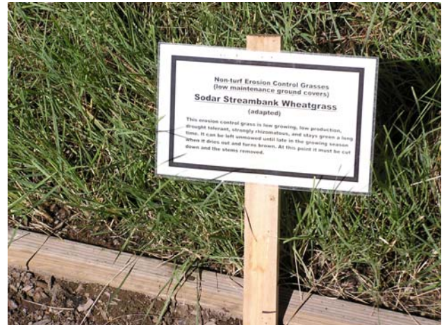
Erosion Control Mix 6: 'Sodar' after three months

EC Mix 6 'Sodar' streambank wheatgrass ( Elymus lanceolatus ssp. psammophilus 'Sodar') was the only grass type in this mix. This erosion control grass is low-growing and spreads readily through underground stems called rhizomes.