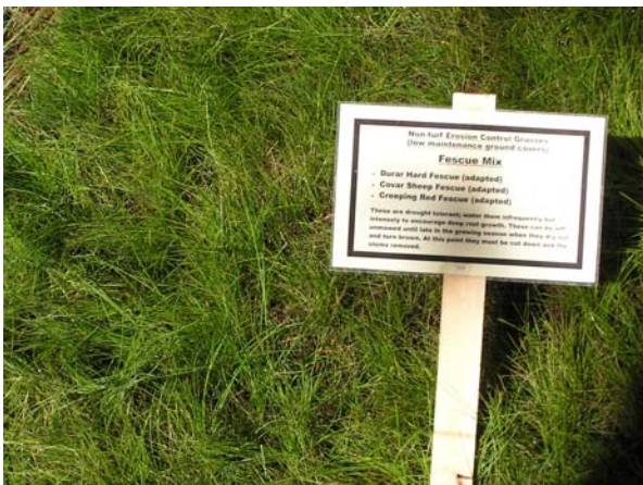
Erosion Control Mix 5: fescues after three months

EC Mix 5 included 'Durar' hard fescue ( Festuca trachyphylla 'Durar'), 'Covar' sheep fescue ( Festuca ovina 'Covar') and 'Boreal' creeping red fescue. Hard fescue and sheep fescue grow in clumps. The spreading growth pattern of red fescue helps fill in bare areas between clumps.