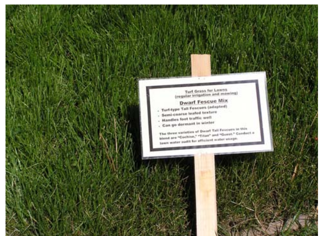
Turf Mix 3: dwarf fescues after three months

Turf Mix 3 had three varieties of dwarf turf-type tall fescues ( Festuca arundinacea ), 'Cochise', 'Titan' and 'Quest'. Turf-type tall fescues can be more heat- and drought-tolerant than Kentucky bluegrass (O'Brien and Hurley, 1986). These grasses have a semi-coarse leaf texture. Because of their late green-up in the spring and early dormancy in the fall, gardeners may have a tendency to overwater these grasses in an attempt to encourage a deep green color.