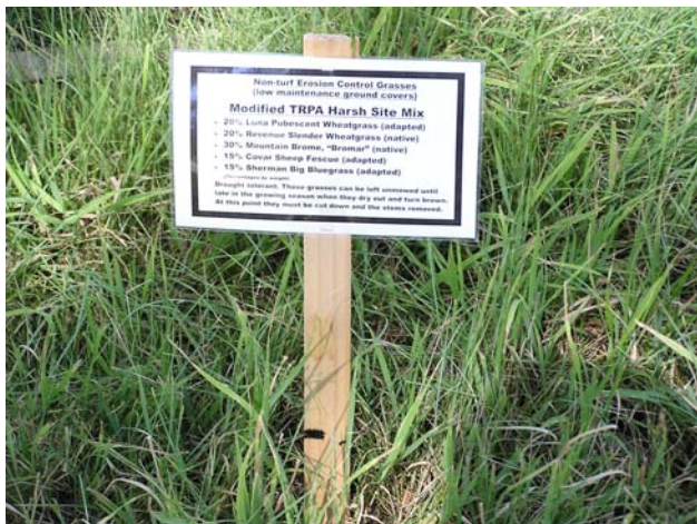
Erosion Control Mix 8: modified TRPA harsh site mix after three months

There are advantages and disadvantages to using 'Luna' pubescent wheatgrass. Some people may find its coarse texture less aesthetically pleasing for a residential landscape. However, it works well on harsh sites. Wildflowers may be added to this mix for color.