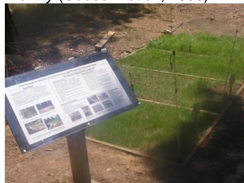
Grass plots and interpretive sign in the North Lake Tahoe Demonstration Garden

In order to show Lake Tahoe Basin residents the characteristics and appearance of these different grasses, University of Nevada Cooperative Extension researchers planted eight demonstration plots of different grass mixes at the North Lake Tahoe Demonstration Garden on the campus of Sierra Nevada College in Incline Village, Nev. Nearly all of the species in these mixes are listed on the Tahoe Regional Planning Agency (TRPA) Recommended Plant list, in the Home Landscaping Guide for Lake Tahoe and Vicinity (Cobourn et al., 2006).