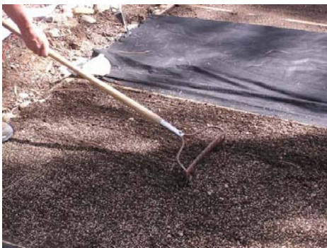
Proper seedbed preparation included raking seed in lightly, adding 1/8 inch of peat moss and rolling the area level.

For seed germination and seedling development, the soil must be kept moist. We irrigated the seeded areas three times a day, 15 minutes per time, with a microspray, for the first six weeks until the grass was 4 inches to 6 inches tall. At that time, we mowed all the grasses to 3 inches tall. However, it is a better practice to mow at 2 inches to 3 inches, cutting the grasses back to 1 ½ inches to avoid ripping out new seedlings. This first mowing helps stimulate a denser root system. We also reduced the irrigation to once per day for all grasses.