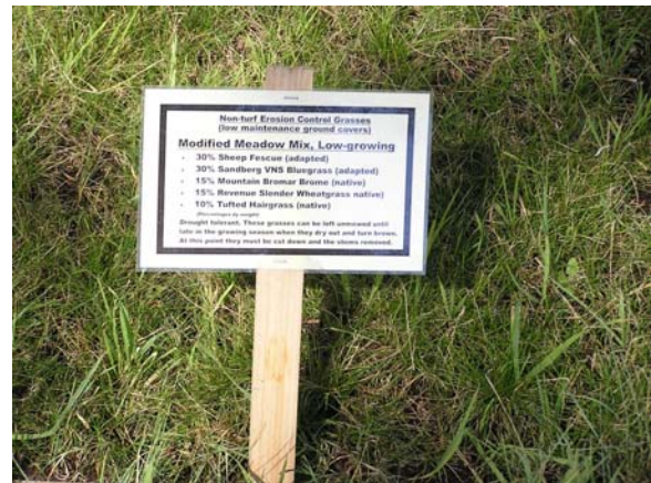
Erosion Control Mix 7: modified meadow mix after three months

EC Mix 7 was a modified meadow mix with 30 percent 'Covar' sheep fescue, 30 percent Sandberg bluegrass ( Poa secunda ), 15 percent 'Bromar' mountain brome ( Bromus marginatus 'Bromar'), 15 percent 'Revenue' slender wheatgrass ( Elymus trachycaulus 'Revenue') and 10 percent tufted hairgrass ( Deschampsia caespitosa ). This low-growing alternative may be mixed with hard and red fescues to increase coverage. Wildflowers may also be added to provide color and the general appearance of a meadow.