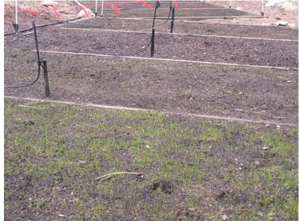
Erosion control grass plots 15 days after seeding. Note the microsprayers used for irrigation three times per day.