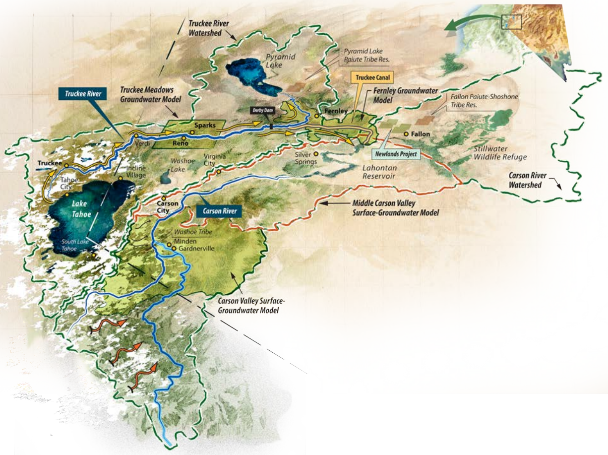
Figure 1. Truckee-Carson River System and hydrologic model boundaries. Graphic design by Kelley Sterle and Ron Oden, University of Nevada, Reno.

Figure 1 provides a map of the Truckee-Carson River System, watershed boundaries (green outline), and call-outs for where hydrologic models exist (red and green shaded areas). Yellow arrows indicate flow of water through the Truckee River and to either the river’s natural terminus (Pyramid Lake) or to the system terminus through the Truckee Canal. Orange arrows represent snowmelt from the Sierra Nevada driving Carson River flow. To focus results on the impacts of changing urban water demand on groundwater resources, as illustrated, the Truckee Meadows Groundwater Model incorporates the Reno-Sparks urban areas. The Fernley Groundwater Model incorporates the City of Fernley.