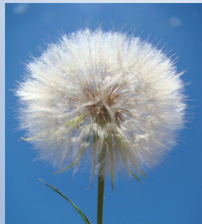
The flower develops into a large, highly visible puff ball.