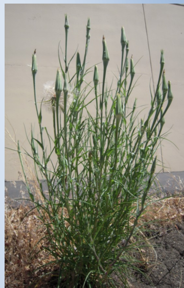
Typical plant growing in a disturbed site.

Reproduction: Reproduces by seed carried on the wind