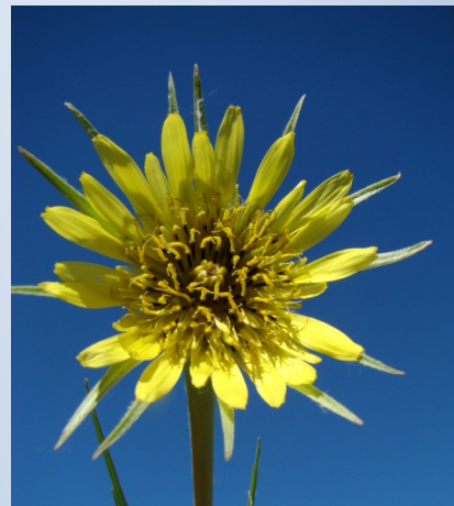
The bright-yellow flowers open early in the day and close by noon.