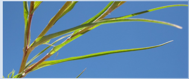
The narrow, grass-like leaves are wider at the base, and can be up to 12 inches long.