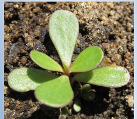
Seedlings have fleshy leaves.