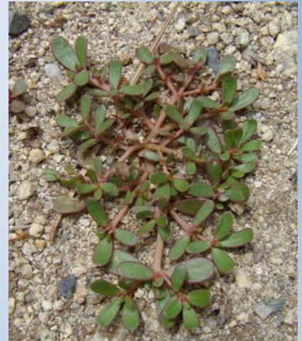
Typical plant growing in a garden.

Reproduction: Reproduces by seed. One plant can produce 240,000 seeds.