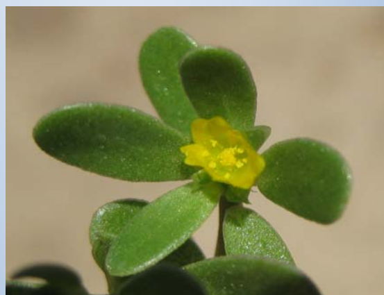
Flowers are tiny, yellow and open only in the sun.