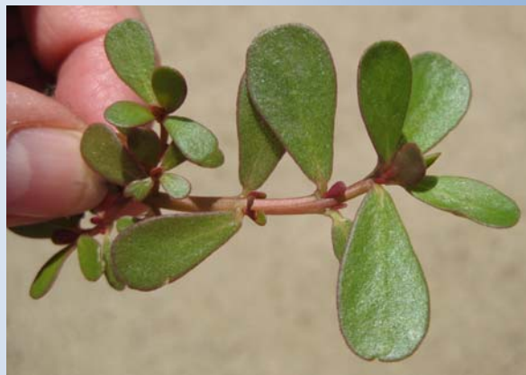
The leaves are fleshy and succulent, and the stems are pinkish.