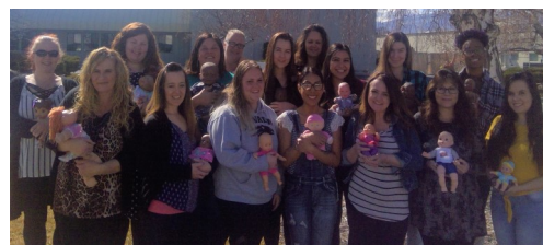
CDA Class of Spring 2020