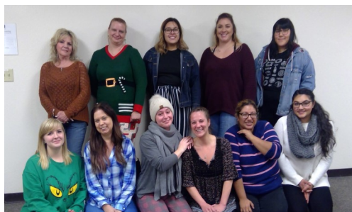
CDA Class of Fall 2019

At this time, 4 participants from the Spring 2020 program are still pending their awards due to COVID-19 situations. There are 12 new program participants in the FALL 2020 program.