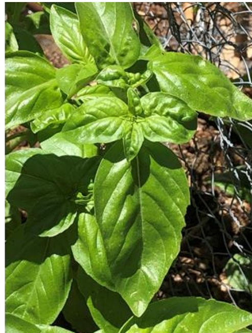
Black Beauty Eggplant and Basil.