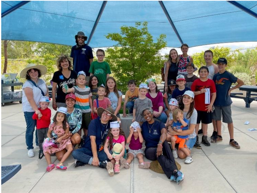
Pearl Home School Group at Botanical Gardens at Extension's Clark County Office location.