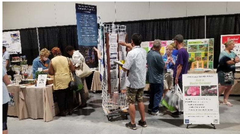
Master Gardener booth at the World Market Center Expo in June 2021.

Master Gardeners will have a booth at the home show Friday through Sunday answering gardening questions and handing out publications and native wildflower seeds. We will be giving some 30-40 presentations or round table discussions on gardening topics. Presentations will last about 45 minutes with a brief question and answer period to follow. Round table discussions are informal with question-and-answer sessions lasting from one to two hours. People will be coming and going. Show hours will be from 10 a.m. to 5 p.m., except it will close one hour earlier on Sunday.