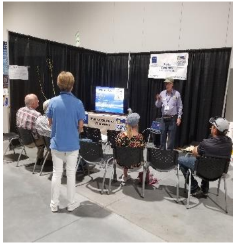
A presentation on the many uses of hemp at the MG booth June 2021 home show.

The Home Show will have a variety of vendors displaying and selling home, gardening, health, and beauty items and services. A schedule listing the dates, times and topics of presentations and round-table discussions will be provided later. Information on our booth at the show can also be obtained by calling our helpdesk at 702-557-5556, Mondays through Friday from 9 a.m. to 3 p.m. except holidays.