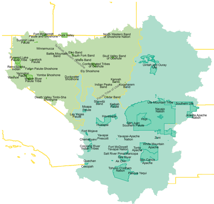
Fig. 1 Approximate location of reservation lands of the 49 federally recognized tribes [Indigenous communities] within the study region

and/or Indigenous communities in order to protect their anonymity and respect their right to data sovereignty. Instead, our study offers a regional assessment of perceived climate information and data needs and includes a cross-correlation analysis based on the three aggregated demographic variables representative of the individuals who participated in this study.