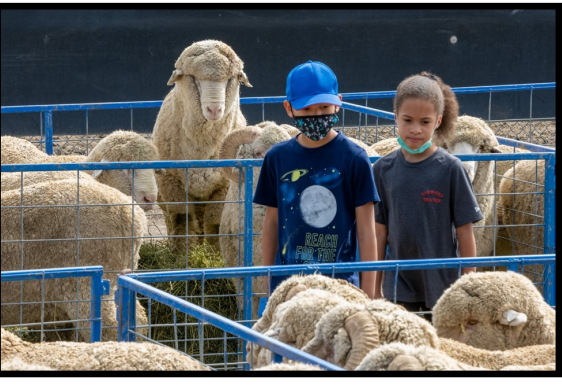
Many Ranchers purchase Rafter 7 sheep to enhance the wool and range hardiness of their herds