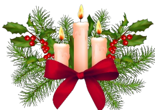
Christmas Day- December 25