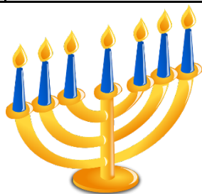
Hanukkah Begins - December 23