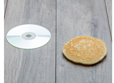
1 small pancake or a small tortilla