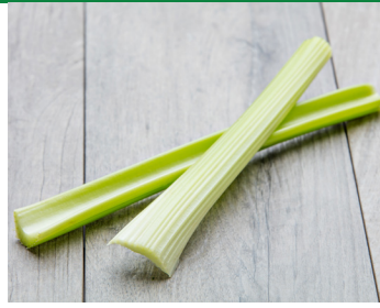
2 large stalks of celery or carrots