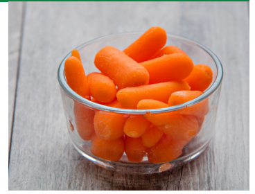
1 cup of fresh, frozen or canned vegetables