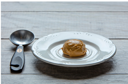
1 tbsp of peanut butter