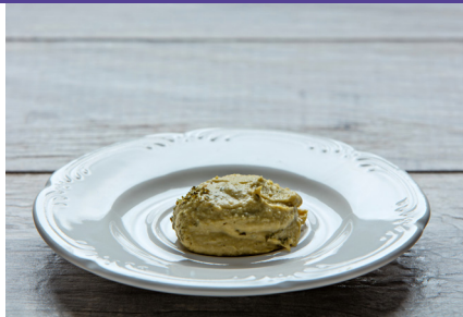
2 tbsp of hummus