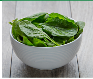
2 cups of raw spinach or leafy greens