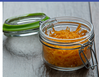
⅓ cup of shredded cheese