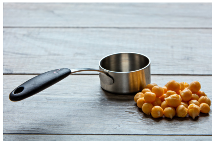
¼ cup of beans or peas