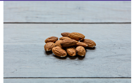
½-ounce of nuts (about 12 almonds)