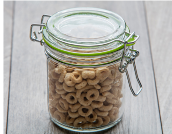
1 cup of cereal or 5 crackers