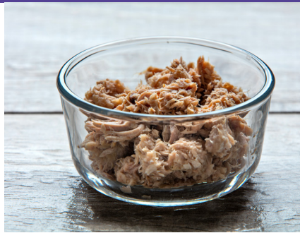
3 ounces of canned meat