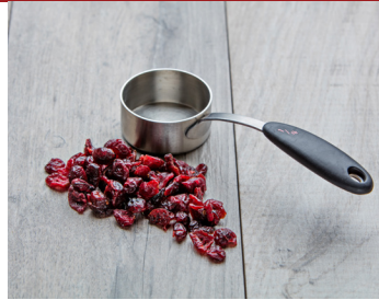
½ cup of dried fruit