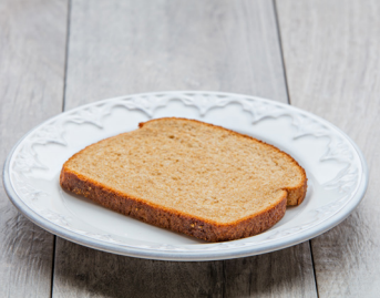
1 slice of bread, ½ of a hamburger bun or ½ of an English muffin