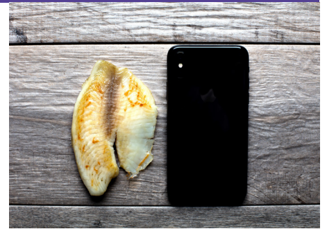
Fish the size of a smart phone