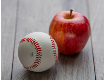
1 piece of fruit the size of a baseball or 2 small fruits, such as plums