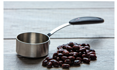
¼ cup of pinto beans