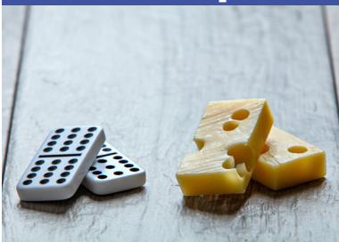
Block cheese cut to the size of 2 dominoes, 1 slice from packaged cheese, or 1 ½ cheese sticks