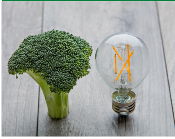
Vegetable the size of a light bulb