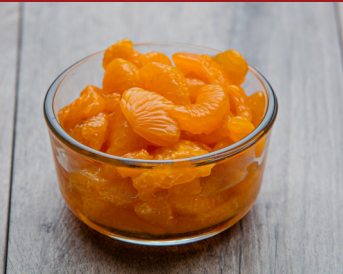
1 cup of canned fruit, frozen fruit, or 100% fruit juice