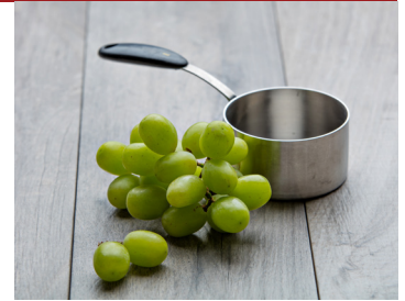
1 cup of green grapes