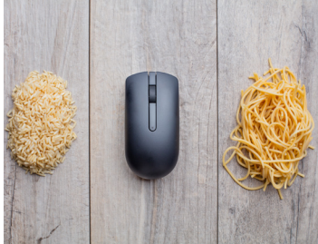
½ cup of cooked pasta, rice or oatmeal