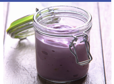
1 cup of yogurt or 2 cups of cottage cheese

Ask yourself with every meal, "Did I get enough servings of each food group?"